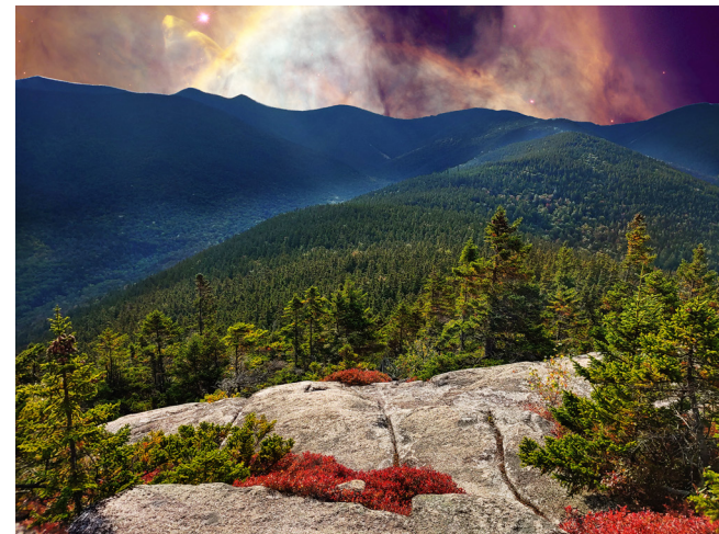
Pulchritudinous Potash, Photography & Digital Collage