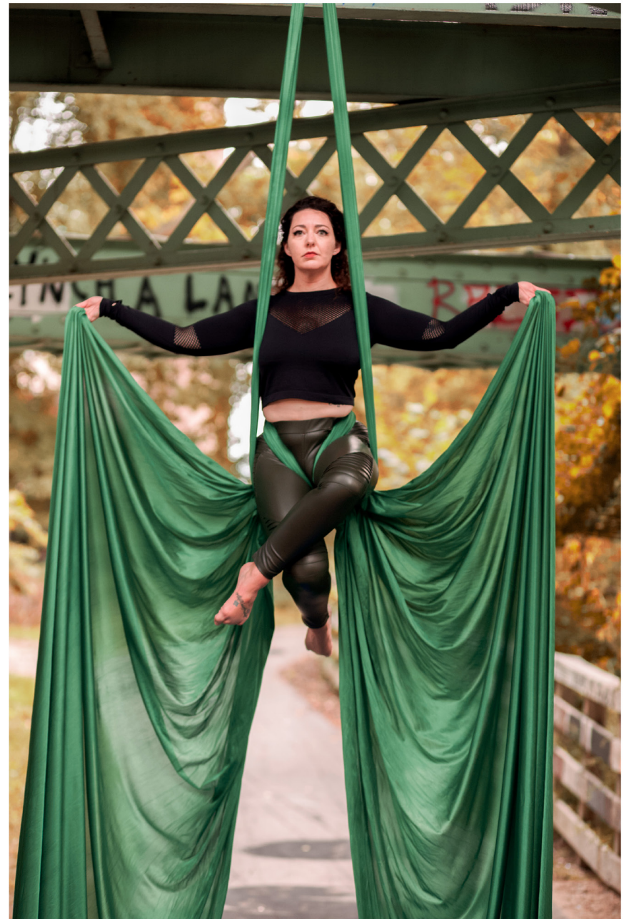
verte, Photograph, 18x12

These collaborative pieces between Logan Ouellette and Shawna Crossman pits the clean, smooth, and graceful aspects of an aerial silk performance next to the dirty, rough, and chaotic setting in which these photographs were taken.