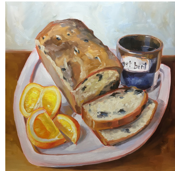
Our Daily Bread #6, Oil on Board, 8” x 8”, 2020