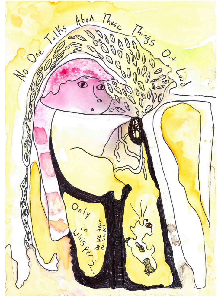
Talking, Watercolor and ink on paper, 5x7

Our collaborative pieces explore our feelings surrounding climate change. As young adults, we feel frustrated that discussions around climate change are not as serious as they should be, and that sometimes we feel silenced by those who do not understand the importance of climate change and its impact on our lives. It is also a struggle to act in ways that will protect our earth and future generations because it feels as though every action is futile compared to the large corporations that cause so much damage to our planet, and the years and years of hurt our planet has endured from our society's collective lack of knowledge. Though these things can sometimes feel hopeless, we can create art that makes a statement and see if that sparks any changes.