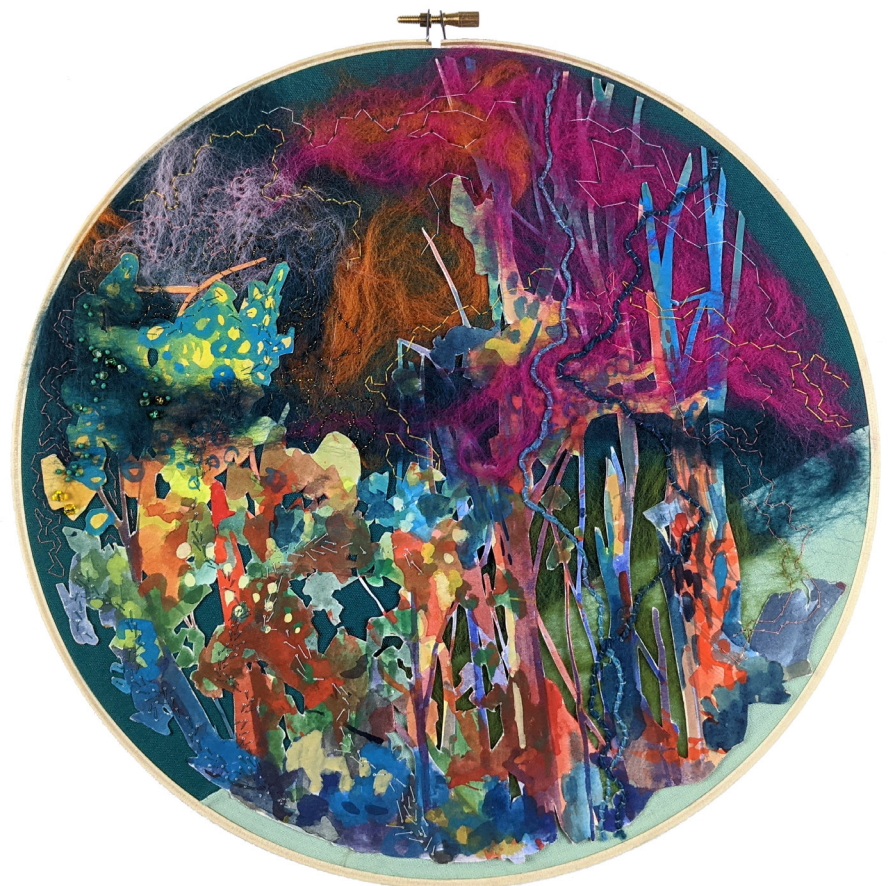
Untitled No. 2, Mixed Media, 12" diameter