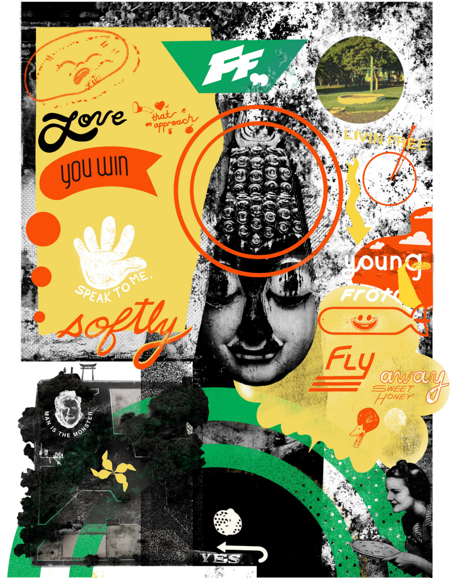
Late Nights in Yangjae, Digital collage

Our piece infuses Scott's photography with Durkish Delights' collage style hidden object art. It's like a Where's Waldo book but with photos from a world traveler meshed together with gritty, contrasted drawings and found images.