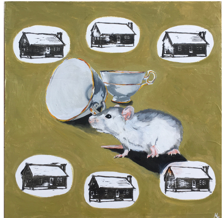
Ekphrasis 3, 10" x10" Oil paint on cradled panel

Unpacks his tea cups; Sees a rat, names it Fred. A home of her own.