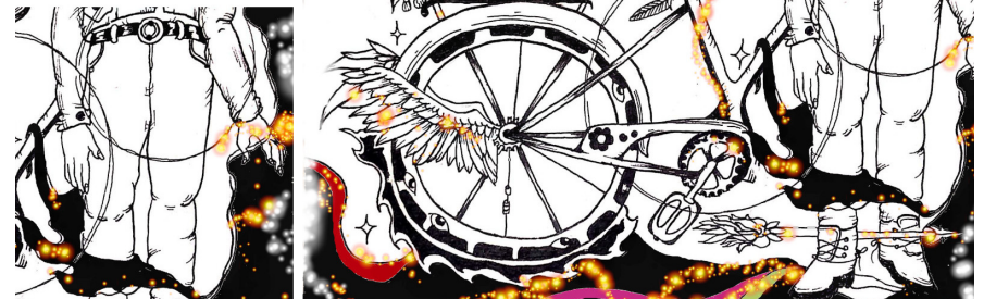
Untitled, pen, ink, digital