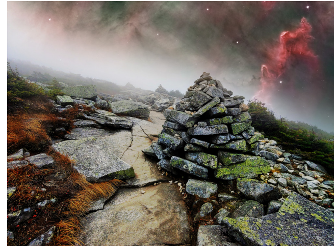
Laudable Lafayette, Photography & Digital Collage

instagram.com/wrightswoman Newmarket, NH