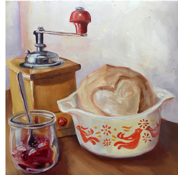
Our Daily Bread #17, Oil on Board, 8” x 8”, 2020

All paintings have been purchased by women who support the project. The work has become a series of pandemic time capsules and the project has strengthened their friendship despite being apart. The series is at 42 works to date and will continue as long as we are in quarantine.