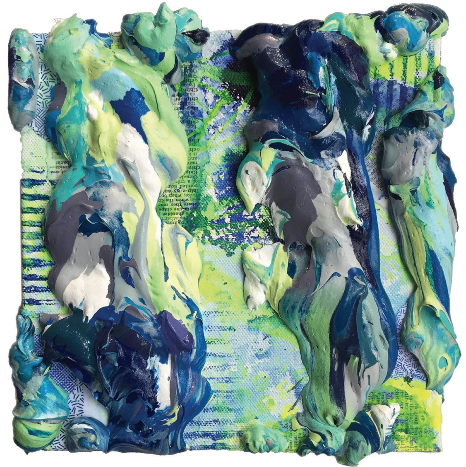
Air Mail Exchange Diptych, Mixed Media on Canvas 10x20