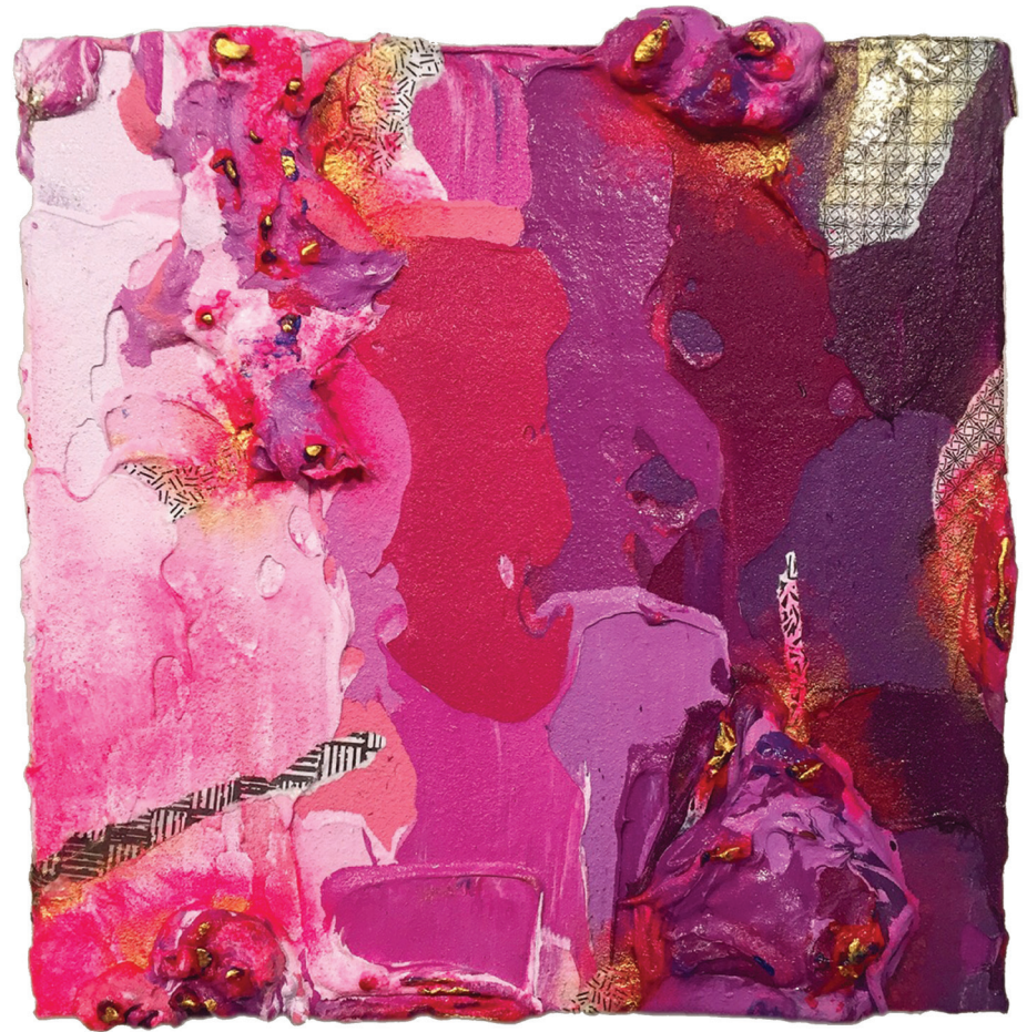
A Violet Exchange Diptych, Mixed Media on Canvas 10x20