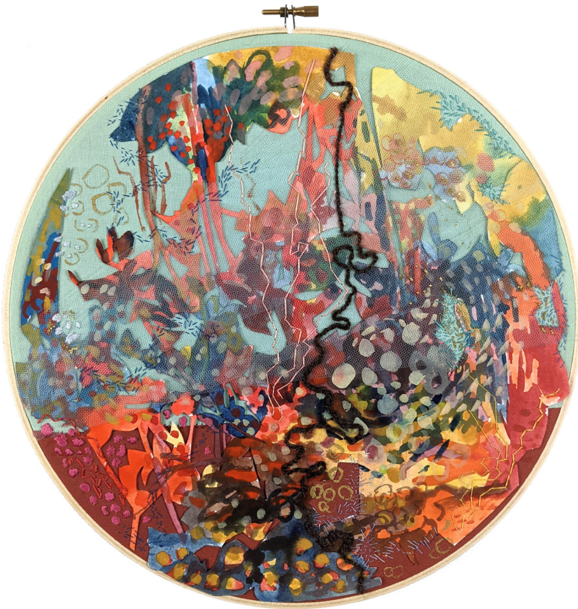
Untitled No. 1, Mixed Media, 12" diameter

These compositions of paint and thread were created by Jennifer Lamontagne and Bri Custer for Dear So and So, a show celebrating collaboration in an innovative way, at Distillery Gallery, Boston in 2019. The work was traded back and forth over six months, gaining and losing bits from each artist along the way. A dialog formed through the process. Bri's gouache was mixed in reaction to Jen's compositions of fabric, and Jen's stitches responded to Bri's shapes in cut paper until they formed a single language. These embroidery-painting hybrids now are products of a conversation between two artists, a collision of two seemingly disparate media. Please email bri@bricuster.com for purchase inquiries.